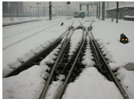
Typical Heated Points Systems Milan, Italy.

HEAT TRACE™ SETTING THE STANDARDS LEADING THE WAY